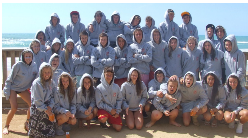
Bronze Camp Group with Camp Hoody's on

All reports from the end of the camp was that everyone had a great time and lots of new friendships were made during the week at Seaspray. I look forward to next seasons bronze camp and see the new group of future lifesavers come through the ranks.