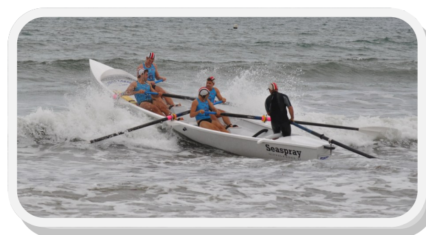
Under 19yrs Boat Crew