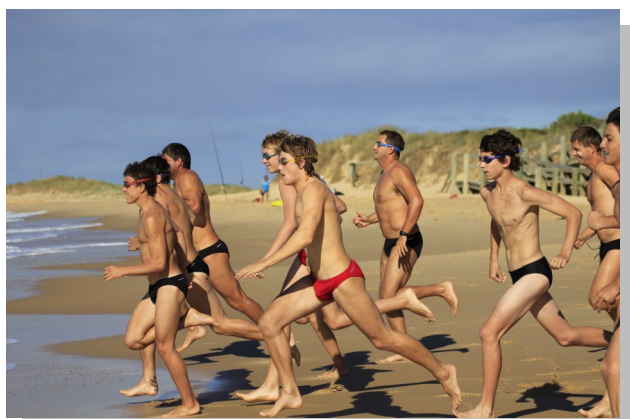
Club Championships Competition