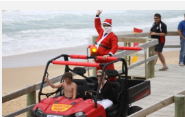
Santa Visit Nippers