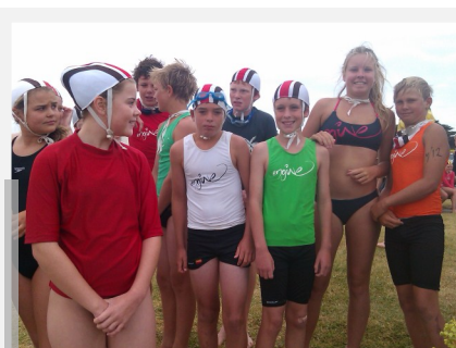
Seaspray Nipper Carnival