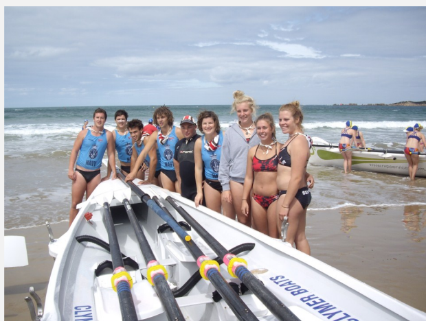
Our Boat Crews at the Victorian Titles