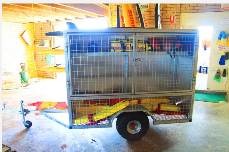
Our new Patrol Gear Trailer

The Patrol Hours on this page are between December 11th 2011 and the 12th April 2012