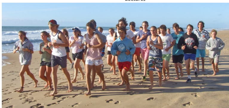
Bronze Camp early morning run.