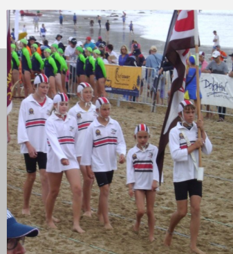
Team at Vic Titles