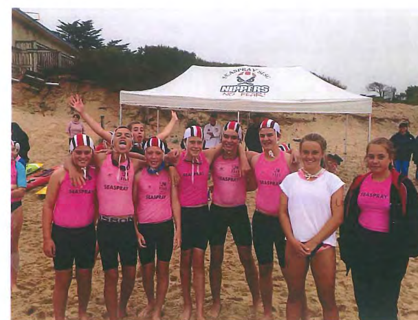
Nippers at Club Champs