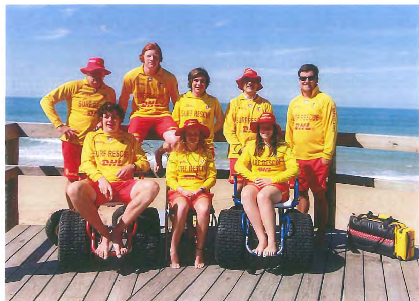
New patrol members 2014/15