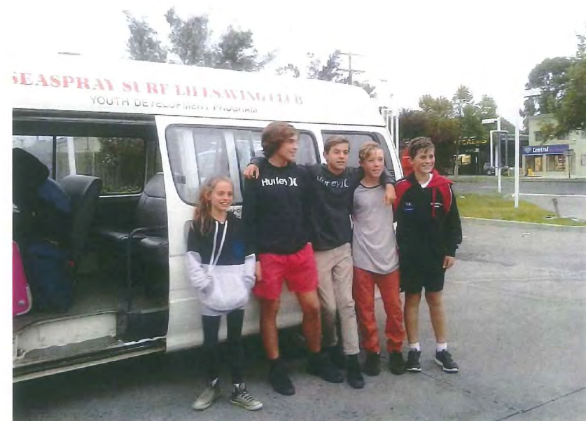
Under 13 Development Camp