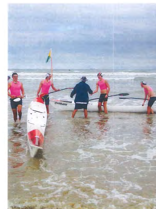
Surf Ski team