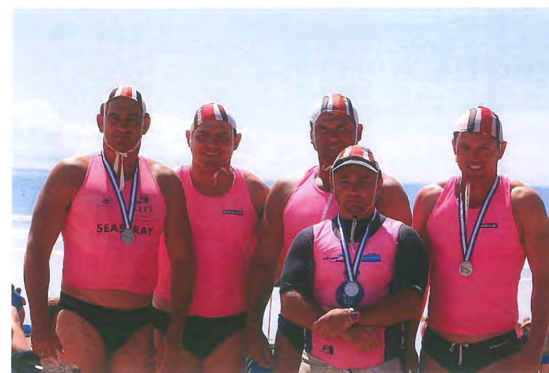
Masters 140 years Team