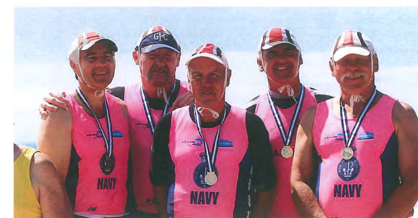
Masters 220 years Team