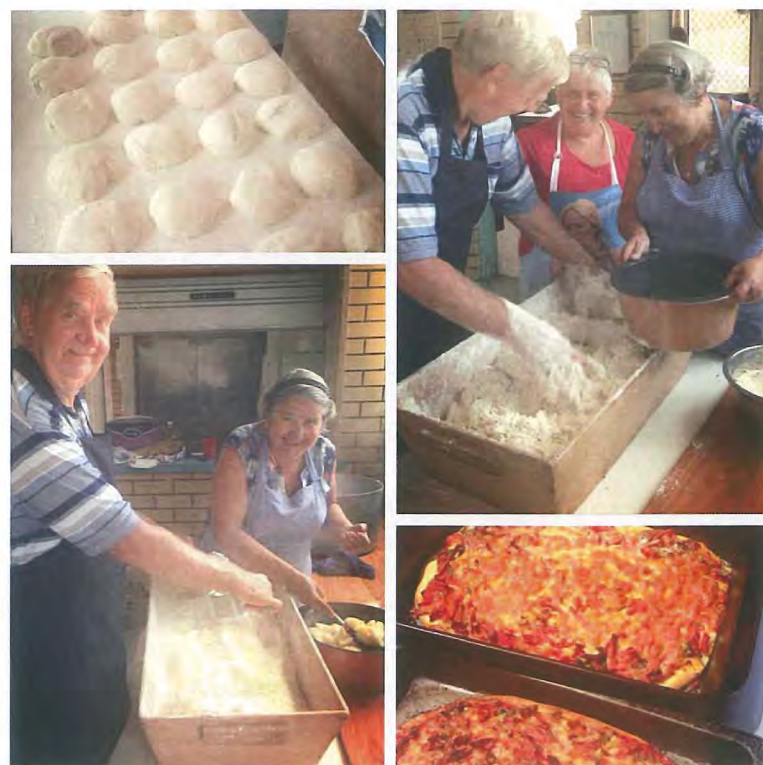
Hard at work