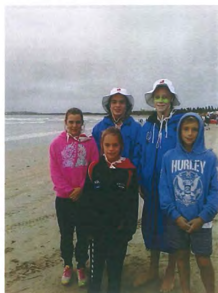
Juniors at State Titles