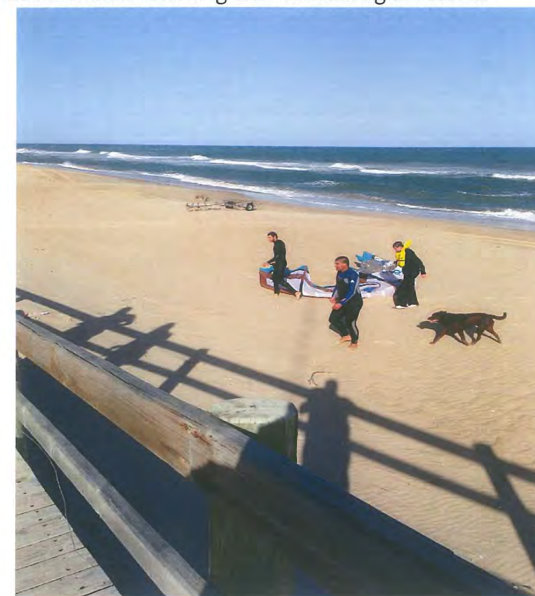
Club members returning after conducting the search