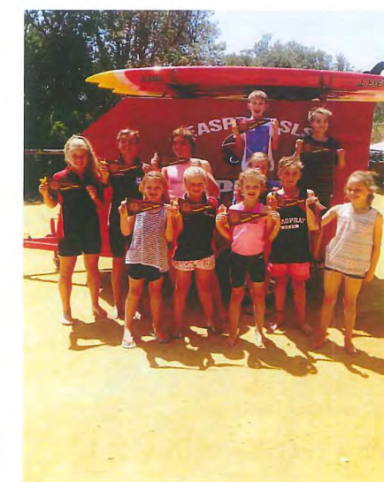
Nippers at Woodside Carnival