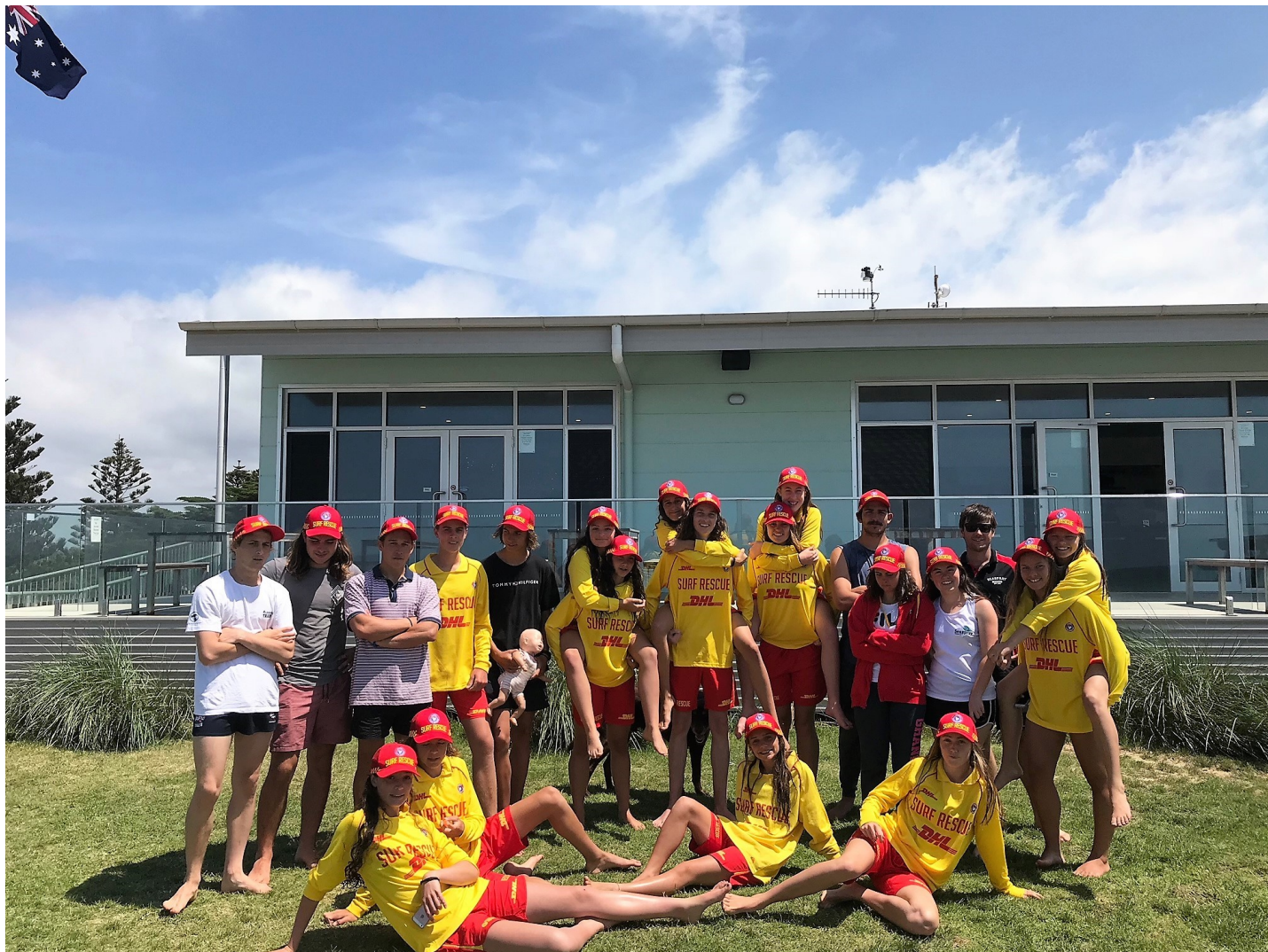
2017 / 2018 Bronze Camp Participants and Instructors

Affiliated with Surf Life Saving Australia and Life Saving Victoria