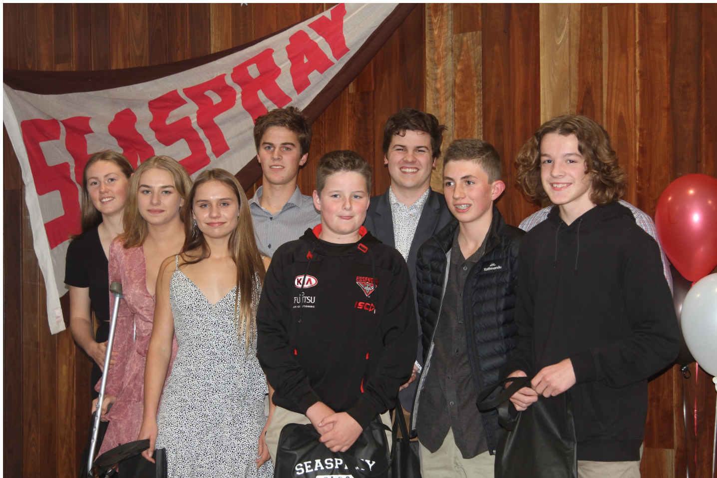
Patrol of the Year

Affiliated with Surf Life Saving Australia and Life Saving Victoria