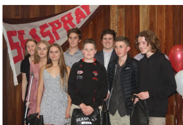
Patrol of the Year Award